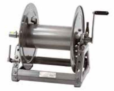
Crank rewind Standard configuration shown