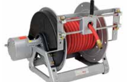
Electric rewind Standard configuration with optional HG-15 hose guide shown