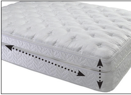
Plus+ Advantage® Patent Pending

The Plus+ Advantage® encasement stretches to fit a variety of depths and lengths.